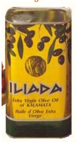
Iliada Extra Virgin Olive Oil, 4L Natural