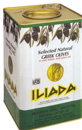
Iliada Organic Kalamata Olives, 13kg Natural