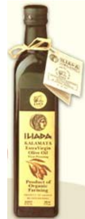
Iliada Organic Extra Virgin Olive Oil Organic