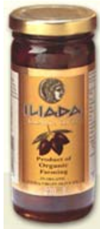
Iliada Organic Kalamata Olives in Olive Oil Organic

All of these products are Wheat-Free, Gluten-Free, Unsweetened, Dairy-Free, and Vegan