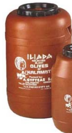
Iliada Natural Kalamata Olives, 13kg Natural

Wheat-free 2: may contain Kamut or Spelt